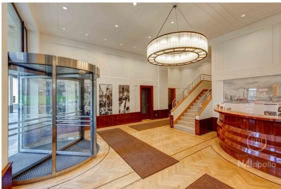
Entree mit Concierge (6)