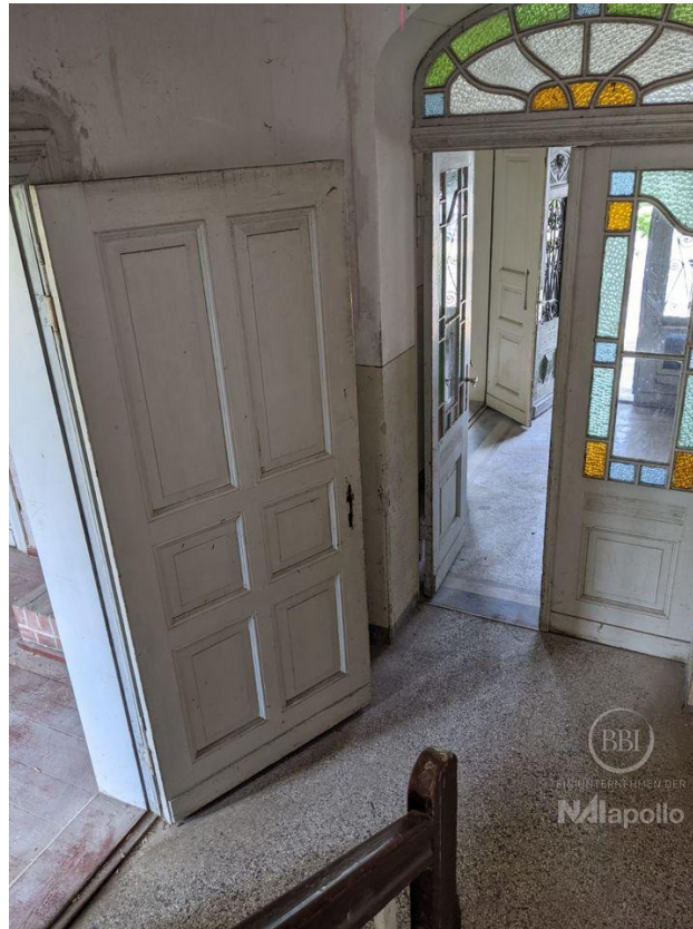
innen - vor Sanierung (6)