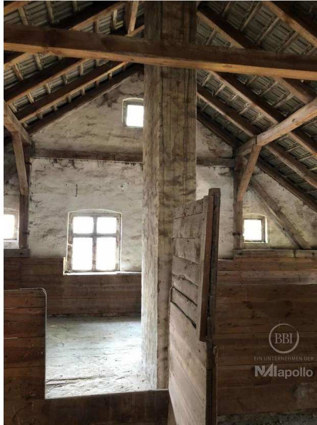
akt Bautenstand (4)