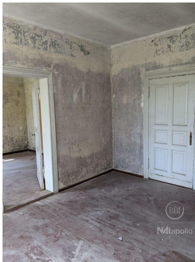
innen - vor Sanierung (3)