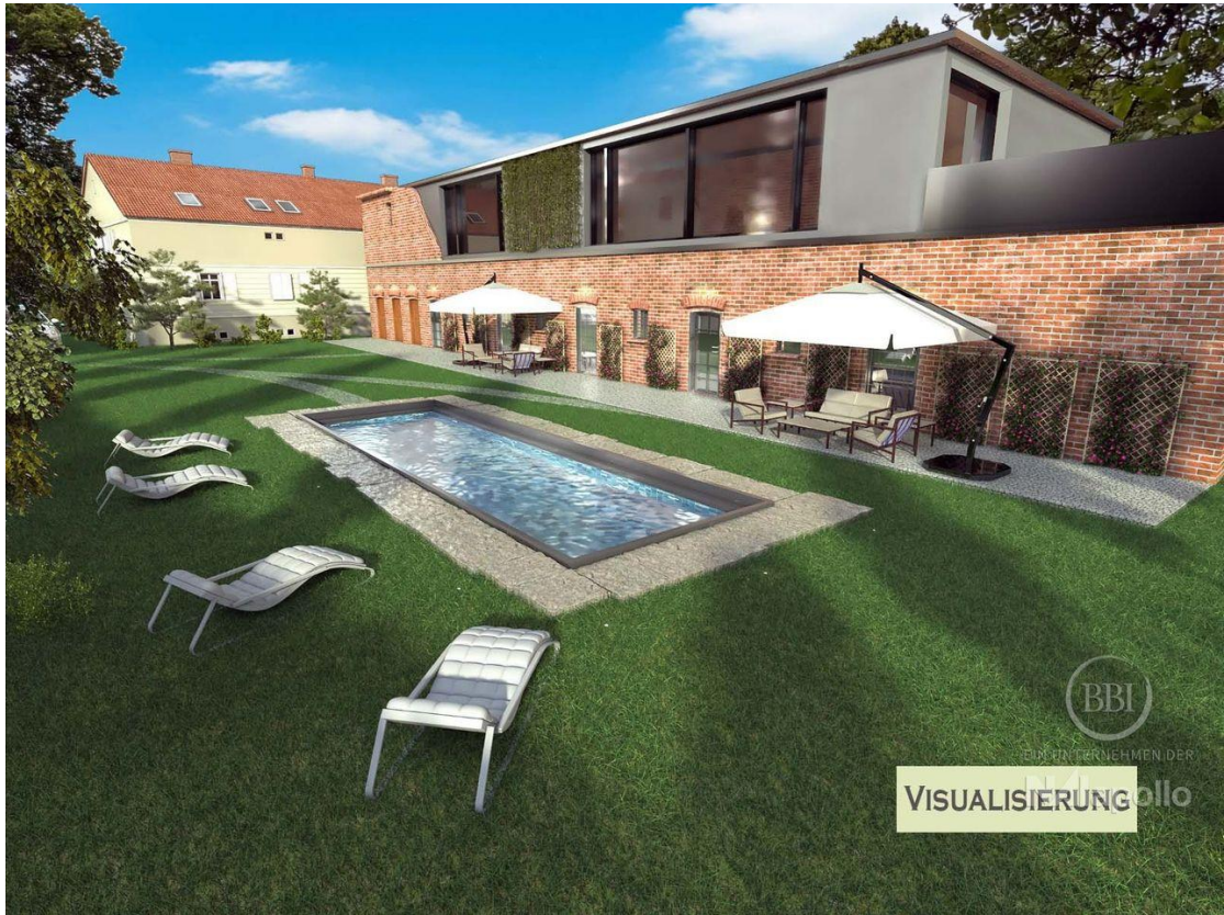
Visualisierung mit Aufbau(1)_