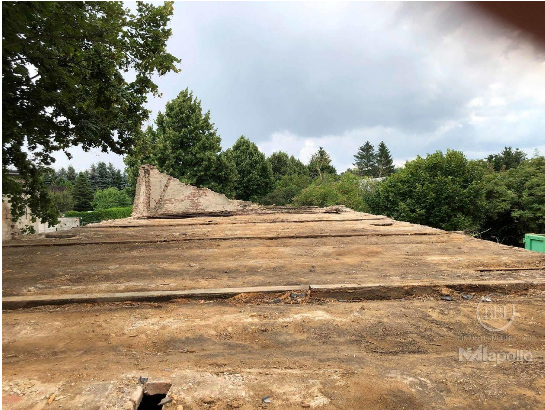
akt Bautenstand (11)