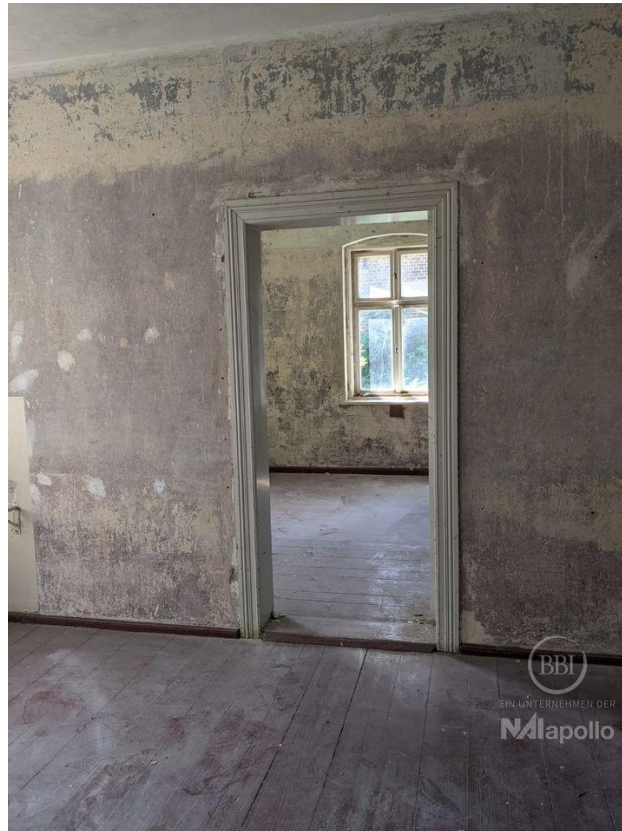
innen - vor Sanierung (4)