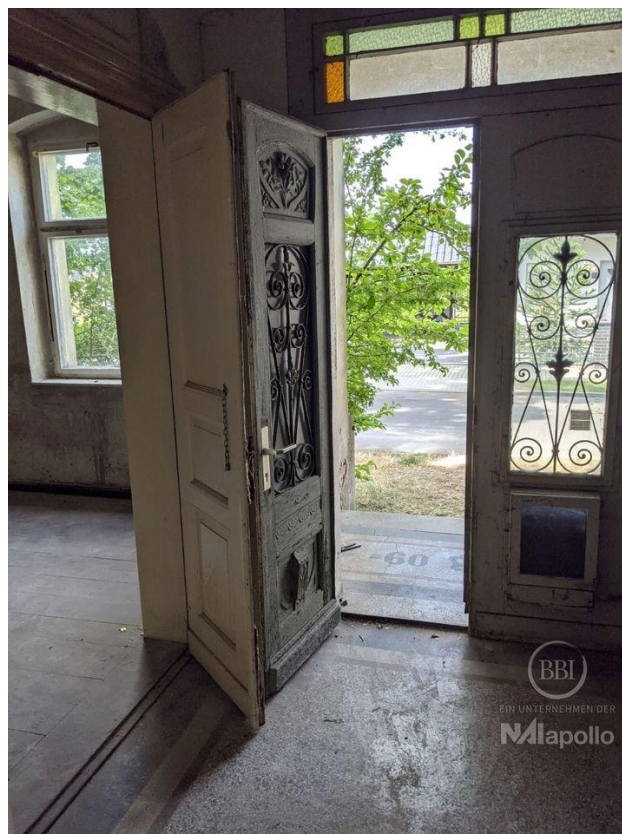
innen - vor Sanierung (2)