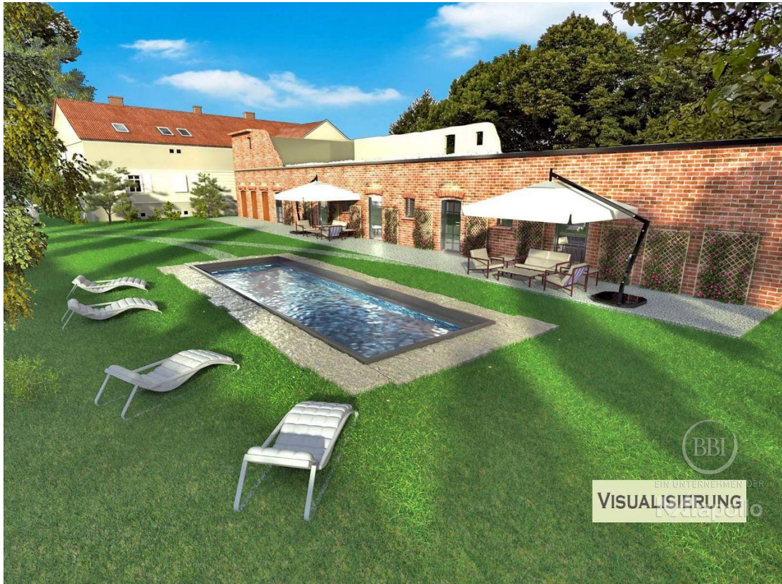
Visualisierung ohne Aufbau(5)_