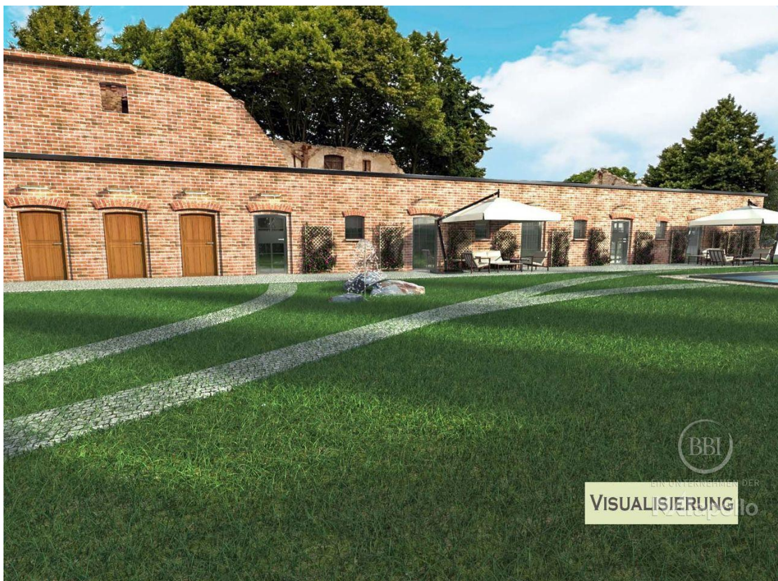
Visualisierung ohne Aufbau (2)_