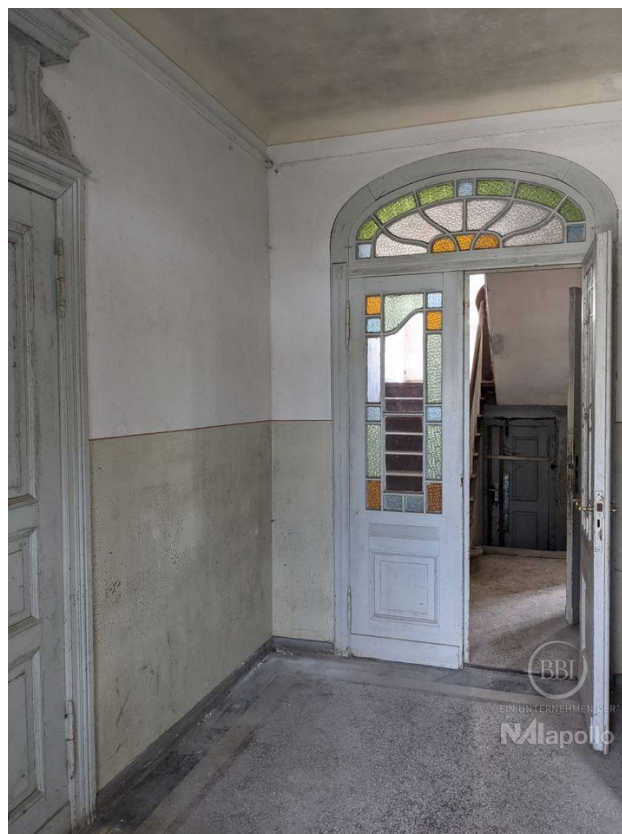
innen - vor Sanierung (5)