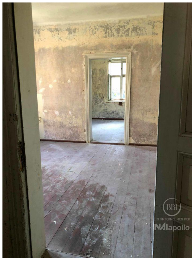
akt Bautenstand (3)