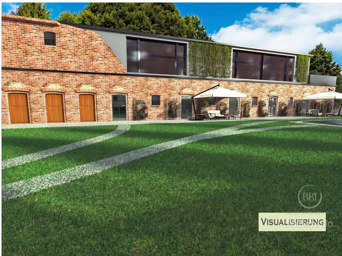
Visualisierung (7) mit Aufbau