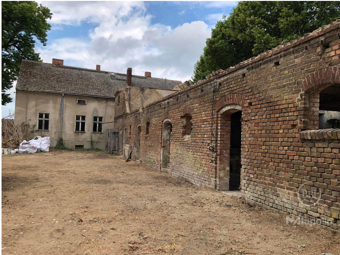
akt Bautenstand (1)